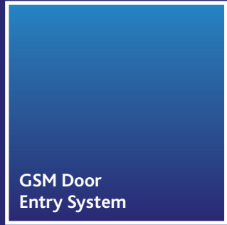
GSM Door Entry System